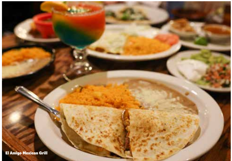
El Amigo Mexican Grill

Housed in the historic Maennerchor building, Julius fuses traditional food from Mexico City with global cuisine featuring a freshly made sauce or salsa with each dish. A fine dining spot serving authentic