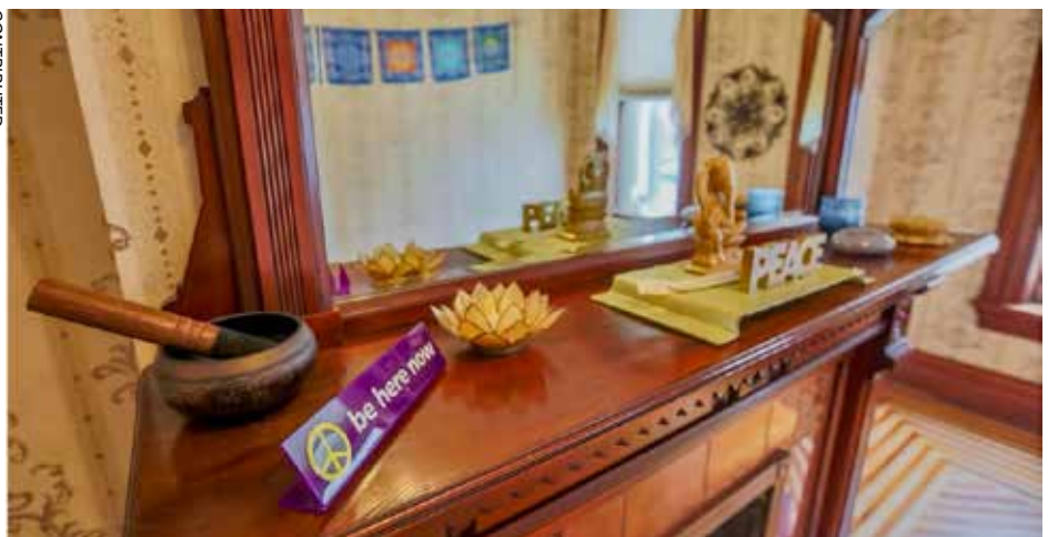
The historic architectural elements of the Victoria Inn built in 1872 like the intricate woodwork, mantelpiece, and original hardwood floors provide wide open spaces and a unique backdrop for yoga practice.

my passion to share this amazing space with more people.”