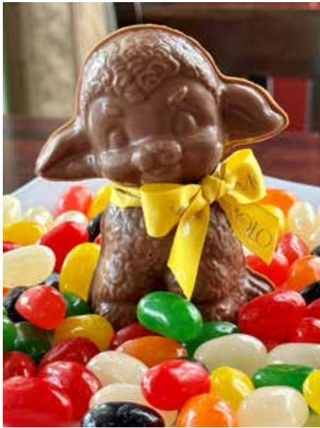
"Sophie," Romolo Chocolates' newest Easter addition, is an improvement upon last year's lamb, and with her signature Romolo ribbon, she is the perfect centerpiece for your Easter basket this season.

ness didn't love. The new lamb comes with a Romolo ribbon around her neck, making her the perfect signature piece for every Erieite's Easter basket this year.