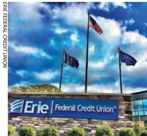
ERIE FEDERAL CREDIT UNION

In addition to serving their members and employees, Erie FCU has made a point to give back to the community here in Erie with their #TeamAOK supporting activities and charitable donations like hosting food drives for the Second Harvest Food Bank, participating in the American Heart Association Heart Walk, donating to Hope on Horseback Therapeutic Riding Center, and local animal rescue Because You Care among many others. Erie Federal Credit Union has shown they care about the Erie community in both their business and leisure time, and the people of Erie have shown they loyally back their favorite credit union.