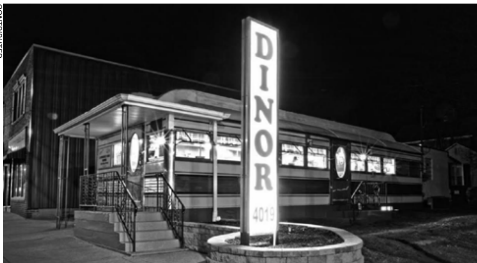
The historic Dinor at Lawrence Park, located at 4019 Main St., is the only diner in Pennsylvania to be listed on the National Register of Historic Places. The business is celebrating their 75th anniversary of serving great food at a fair price.

On Sunday, breakfast and pie are offered all day.