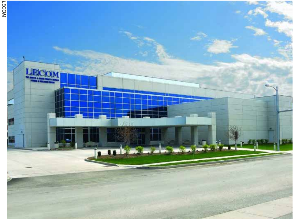
LECOM has expanded their footprint locally to include the John M. and Silvia Ferretti Medical and Wellness Center (pictured), along with an astounding number of other medical and educational health care facilities since their inaugural class began in 1993.