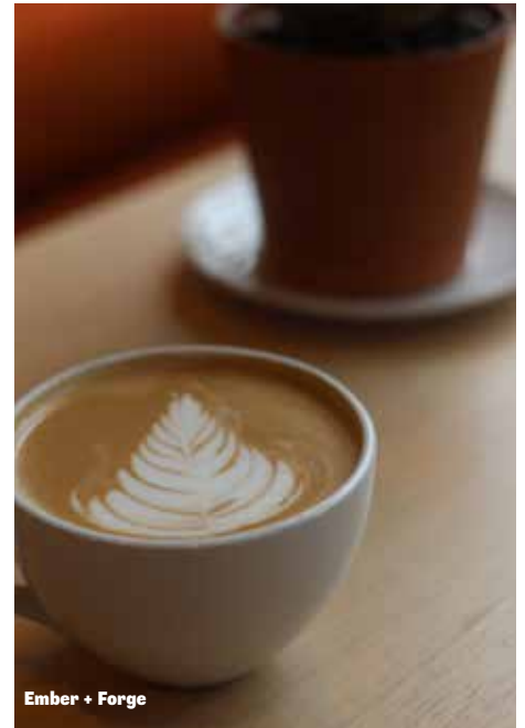
Ember + Forge