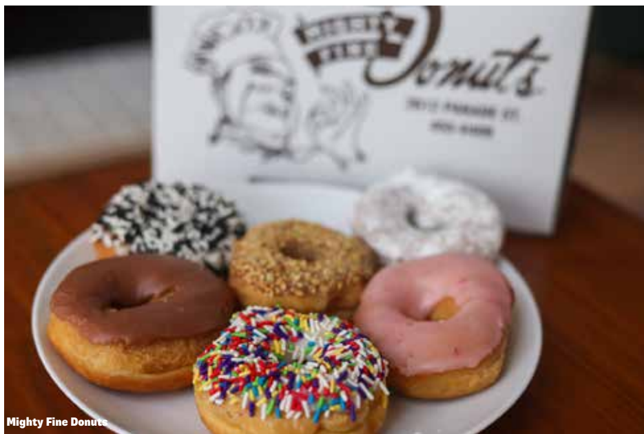
Mighty Fine Donuts

Established in 1916, generations of Pulakos owners have made their mark on the confectioner business in Erie. That legacy is carried on today at two locations serving up melt-in-your mouth chocolate goodness.