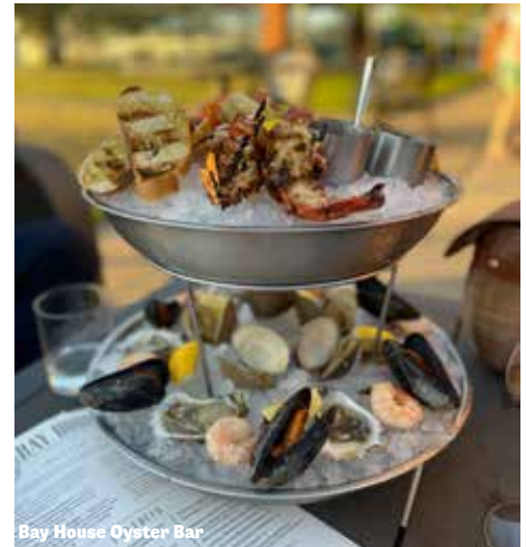
Bay House Oyster Bar

With two convenient locations, the Erie Food Co-Op offers fresh, healthy sand-