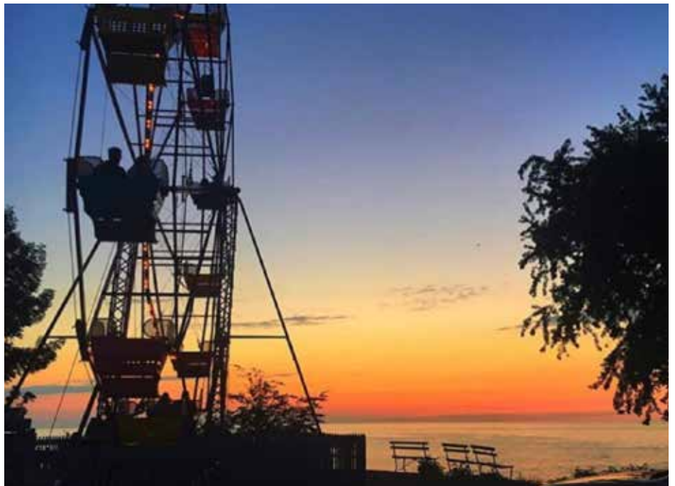
A short drive east of Erie takes you to Chautauqua Lake (top) in Western New York for boating, fishing, and water recreation, while about an hour's drive west of Erie lands you in the small resort village of Geneva-on-the-Lake, Ohio (bottom right).

One could make a day out of simply driving around Titusville (or nearby Oil City and Franklin) and looking at the historic homes.