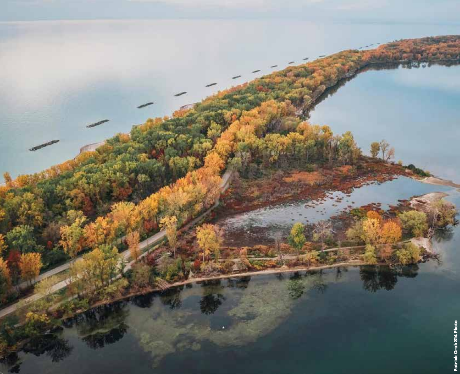
Patrick Grab 814 Photo